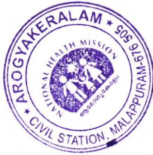
District Programme Manager Arogyakeralam, Malappuram